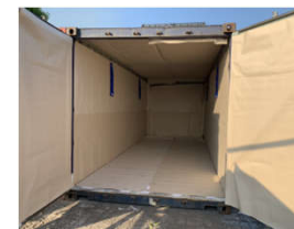
Fumigated empty container