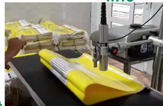
Date stamping line