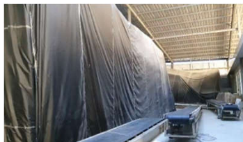
Rice being fumigated at warehouse for 7 days