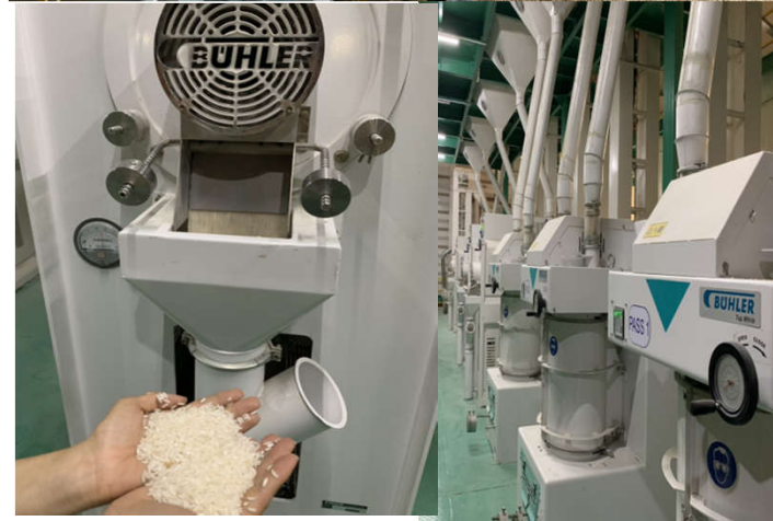
Rice processing line